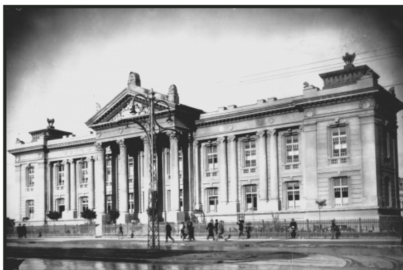
Belgrade University Library