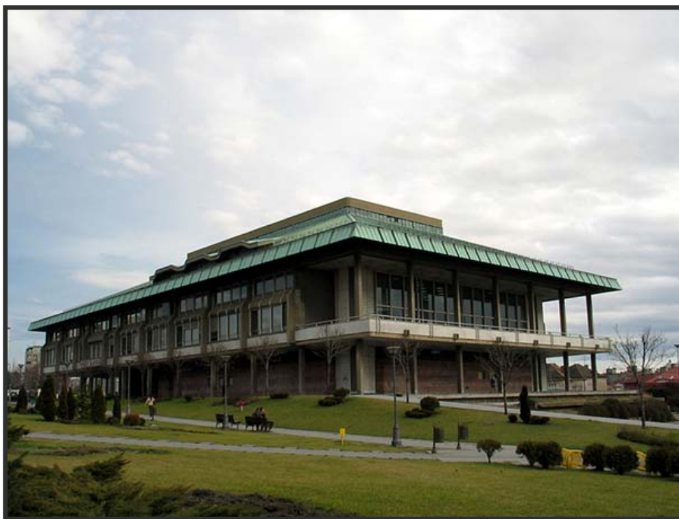
National Library of Serbia

Bulevar kralja Aleksandra 71, 11000 Belgrade, Serbia